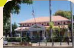
NOUMÉA CITY MUSEUM Place des Cocotiers, Downtown. Open Monday to Friday, 9 a.m. to 5 p.m. & Saturday 9 a.m. to 1 p.m. and 2 p.m. to 5 p.m. Tel 26 28 05