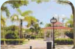
PLACE DES COCOTIERS