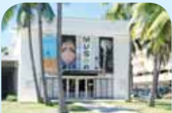
MUSEUM OF NEW CALEDONIA