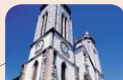
SAINT JOSEPH'S CATHEDRAL A Gothic cathedral in the tropics. Rue Monseigneur-Douarre du Temple, Downtown.