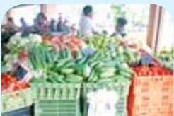
NOUMÉA CITY MARKET